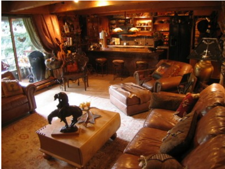
Chateau Eau Claire Condo

400 East Hyman Ave. • P.O. Box 12368 • Aspen, CO 81612 • 970.925.6866