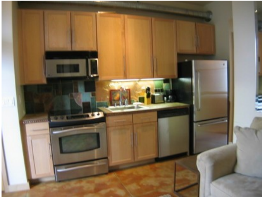
Core Galena Street Long Term

400 East Hyman Ave. • P.O. Box 12368 • Aspen, CO 81612 • 970.925.6866