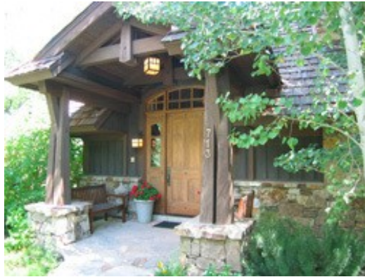
Maroon Creek Townhome

400 East Hyman Ave. • P.O. Box 12368 • Aspen, CO 81612 • 970.925.6866